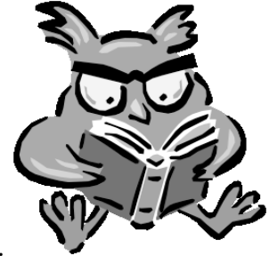
What are Databases?

So, your professor has asked you to do research for an upcoming assignment. They may have also asked for "scholarly journals," or "peer reviewed sources," or they have told you to use the LAVC library in some way. This handout will help you get started using the LAVC Library to do research. Even if you are familiar with the library, this handout may give you some helpful tips.