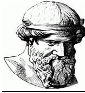
Figure 4 an image of Plato