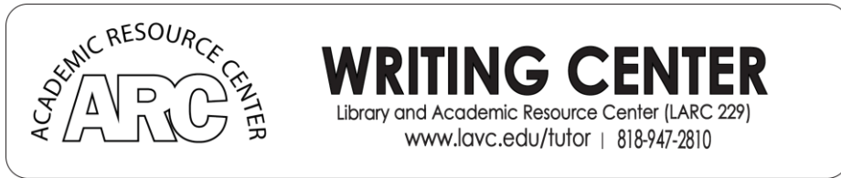
Figure 1 The Writing Center and Academic Resource Center logos