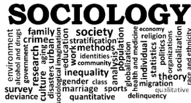
Figure 2 A collage of words and phrases associated with Sociology