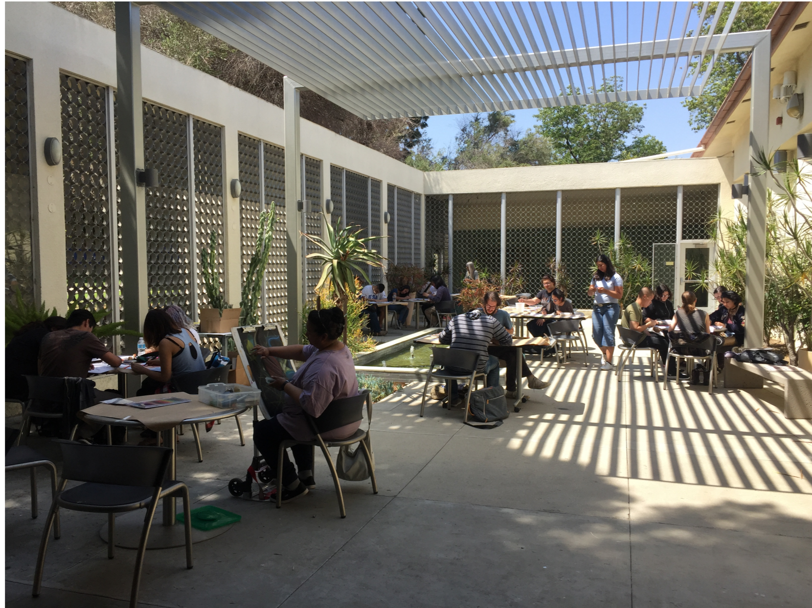
Drawing Day Student initiated college-wide event May 2017