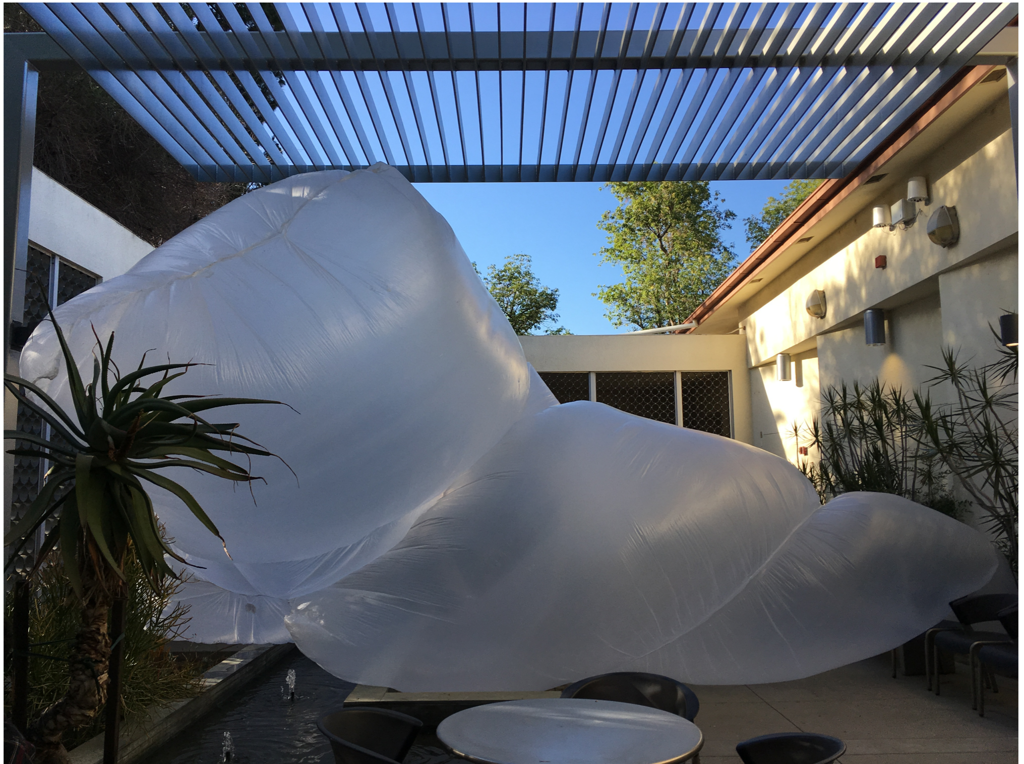
Student work from LAUNCH, Third Place award winner